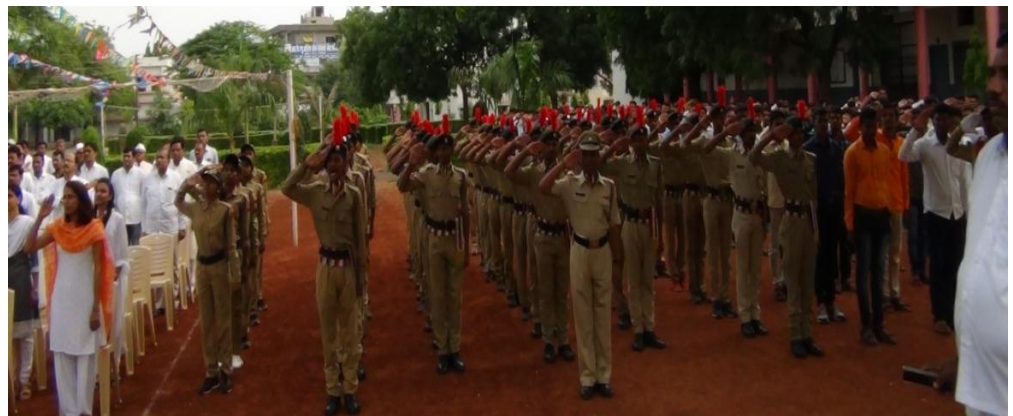
NCC Squad and others saluting National Flag.