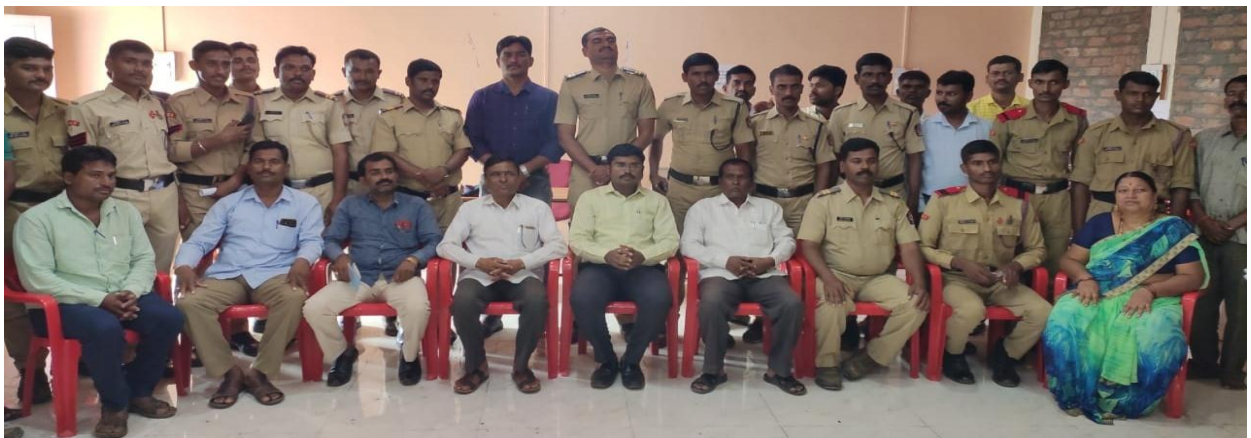
Search and Rescue team of Georai taluka with trainer