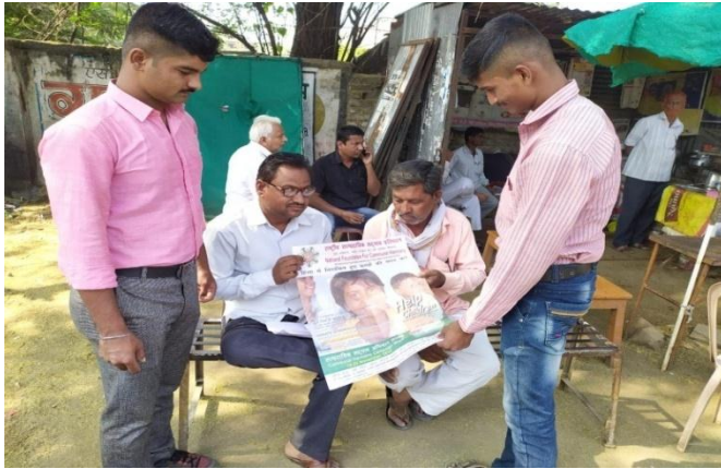
Cadets explaining NCHF fund

National Foundation for Communal Harmony observes communal harmony campaign week. Flag stickers are given by them for fund raising to enhance the resources of the foundation to carry out activities on various schemes and projects. Flag stickers gives the message of communal harmony and national integration. These stickers were distributed amongst the cadet and appealed them to collect the fund by convincing the peoples to donate fund. Cadets enthusiastically worked and collected fund Rs.10,200/- .This amount is given to college and Demand draft of Rs.10188/- ( DD no- 069574 dated 20/01/2020) send to The Secretary, NFCH, New Delhi.