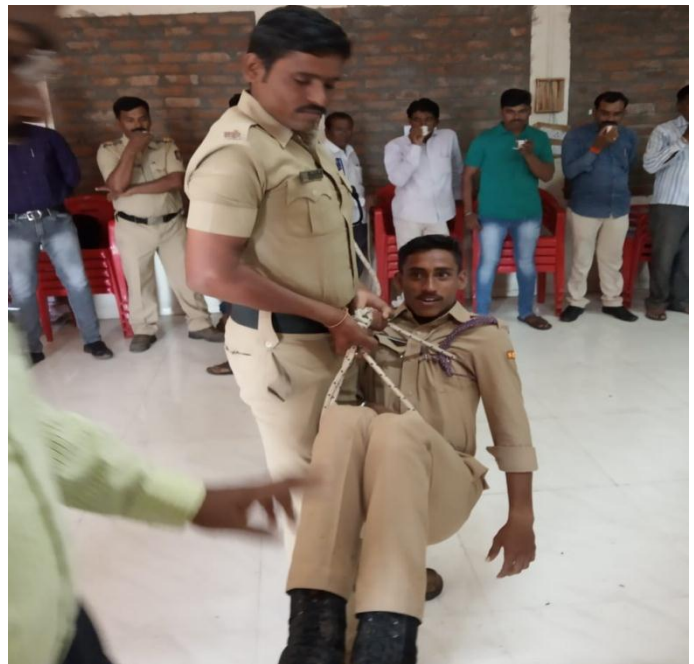
Training for how to carry injured person in disaster