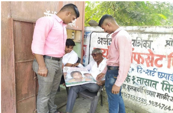
For collection of fund cadets explain NCHF Individually.