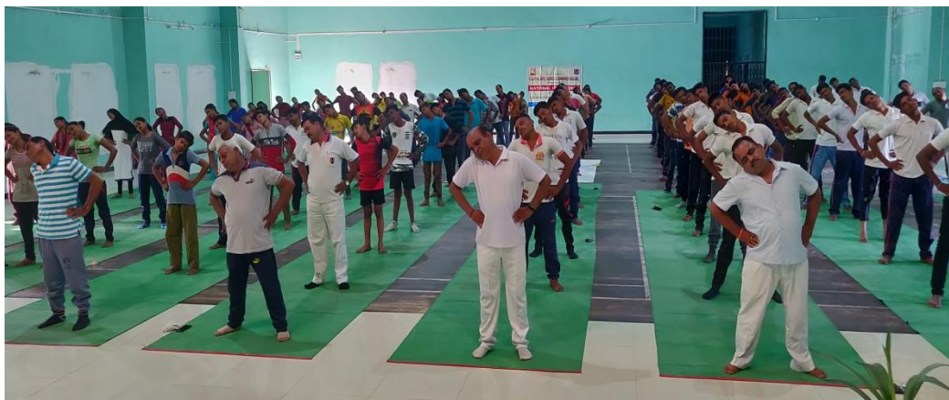
Doing exercise for neck during International Yoga Day Programme