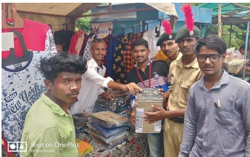
Cadets & Volunteers collecting relief fund from Small Shopkeepers.