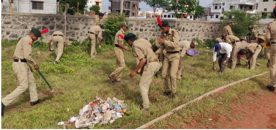
Cadets collecting the garbage outside of running track.

Swachhata abhiyan was conducted on college ground under guidance of Principal Dr. R V Shikhare. After the tree plantation programme, it was observed that, there was garbage due to programme on College ground, so it was decided to clean the college ground on August 29, 2019. Cadets collected this garbage and burned. The 400 meter running track was become a clean.