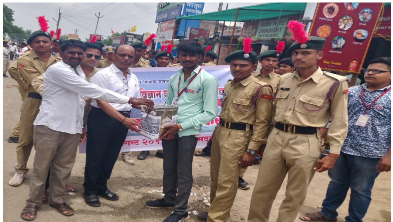
People donating fund enthusiastically