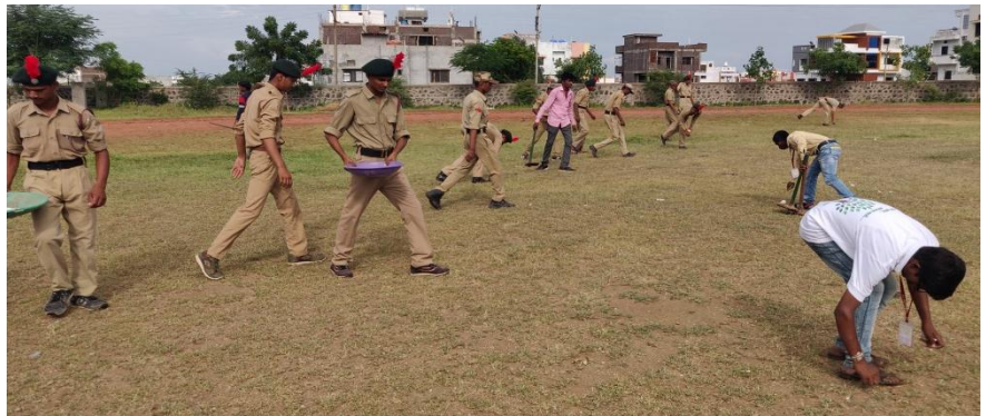
Cadets collecting small garbage spread on ground