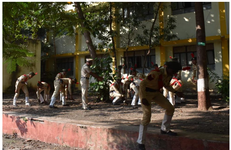
Cadets cleaned the college capus.