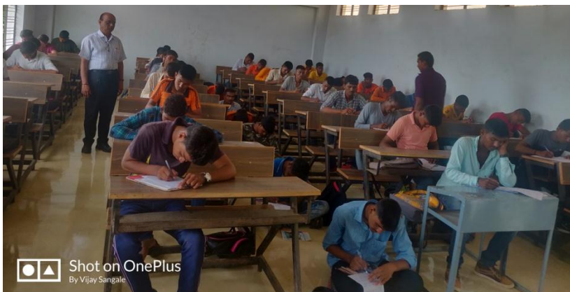
Students giving written test.