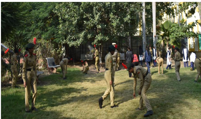
Girl cadets cleaned the garden area in college.