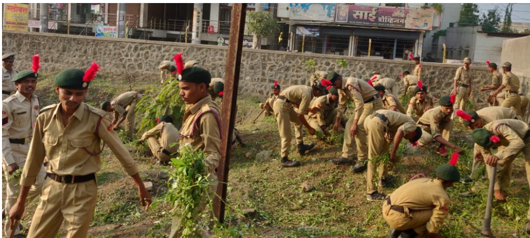
Cadets cleaned the hostel area enthusiastically.