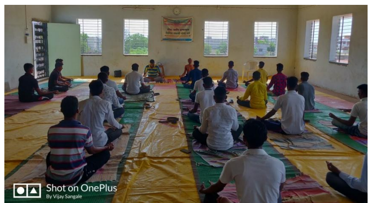
Cadets doing Pranayam under guidance of Yog Guru.