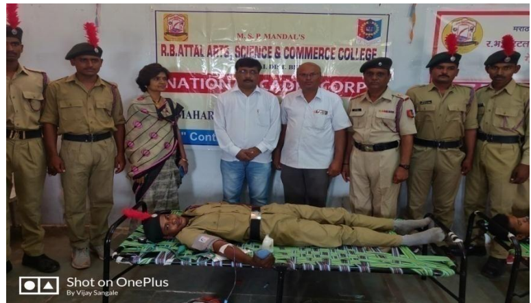
Blood donation in presence of Principal, Vice Principal & Medical Officer.