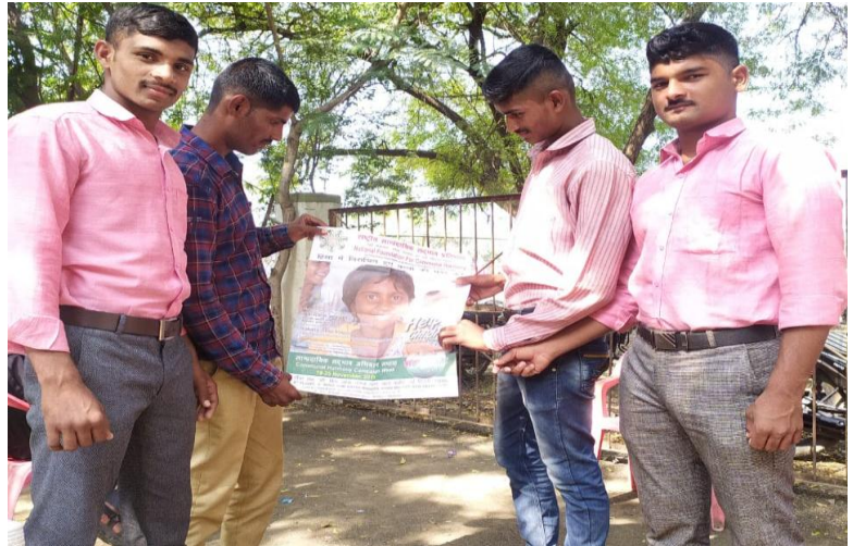
Cadets showing the poster given by NCHF