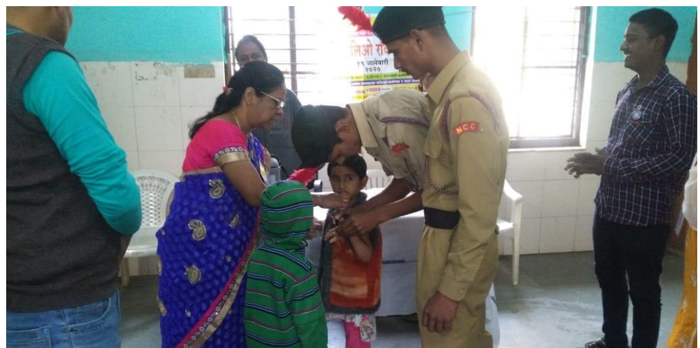
Cadets motivating Childs to take pulse polio drops.