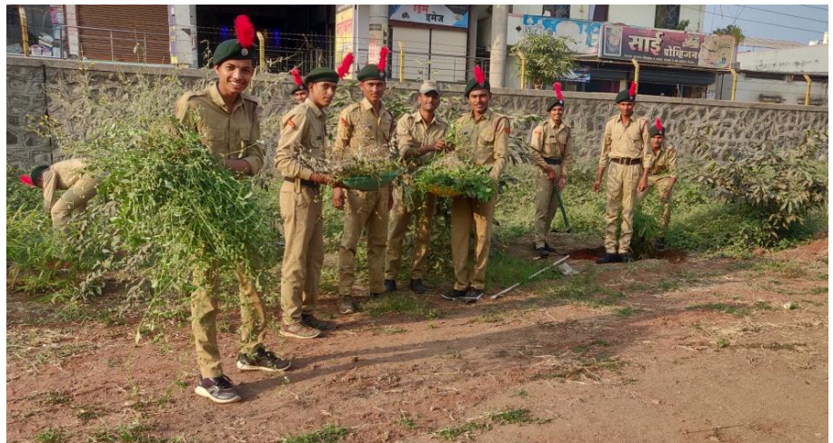
Cadets cutted the grass collected it to one place where it can be burn.