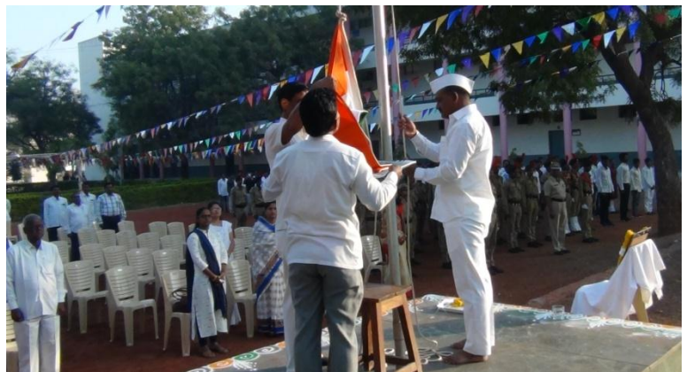
NCC Cadets present for Flag Hoisting Ceremony