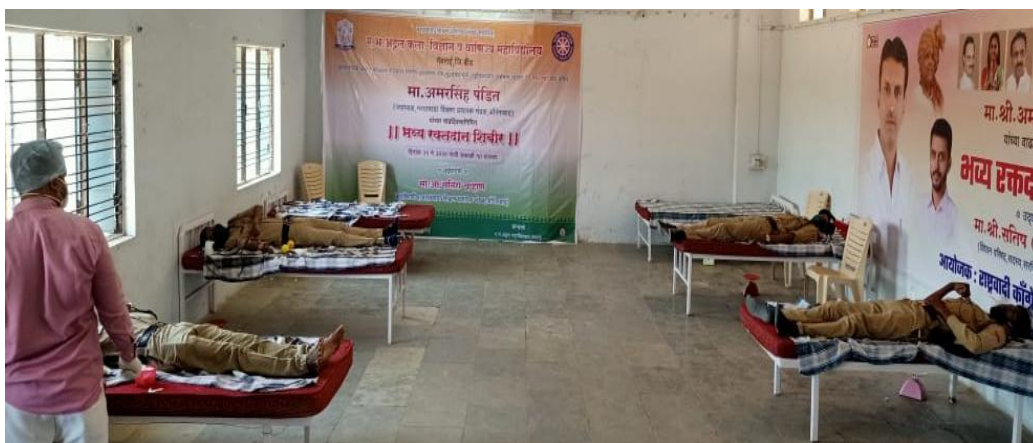
Cadets donating Blood in the camp with norms and conditions of Government.