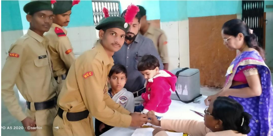
Cadets helping to Pulse polio immunization drive team

Twelve (12) cadets of college NCC platoon were participated in national Pulse polio immunization drive conducted by Medical Superintendent, Sub district Hospital, Georai on January 19, 2020. Cadets actively helped people to give pulse polio drops to their kids. They also cooperated the team of hospital to implement the drive successfully.