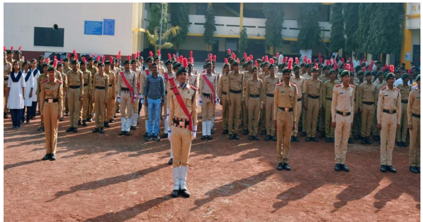
Cadets present on Flag hoisting ceremony.