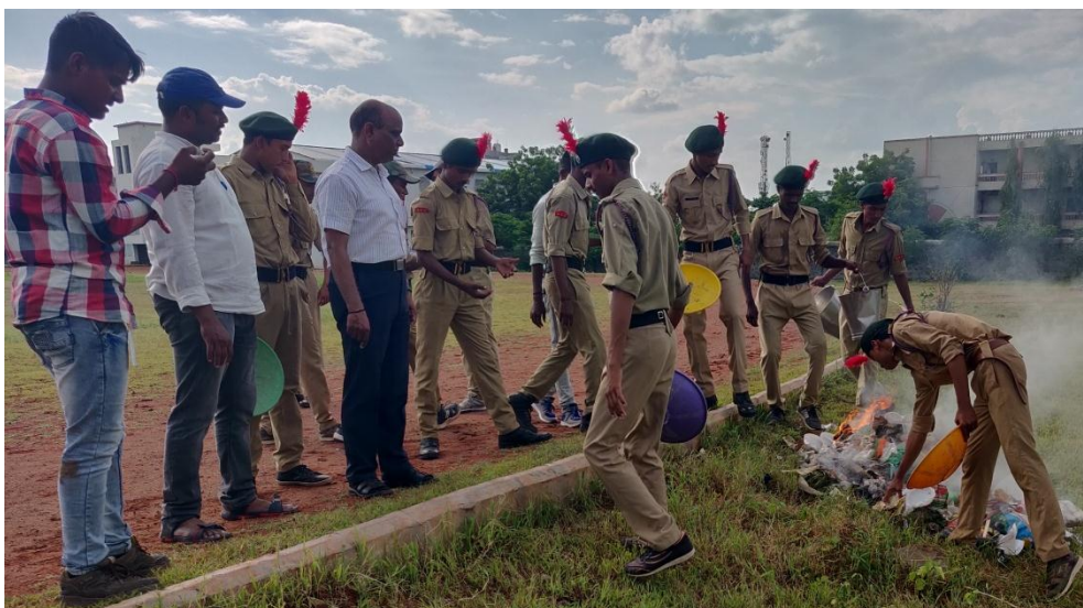
After collecting the garbage cadets burned it.