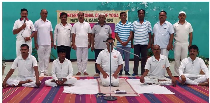
Yoga guru and Dignitaries present on International Yoga Day Programme