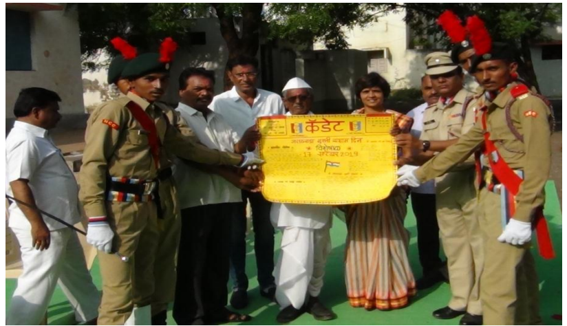
Wallpaper 'Cadet' was published by hands of guest.