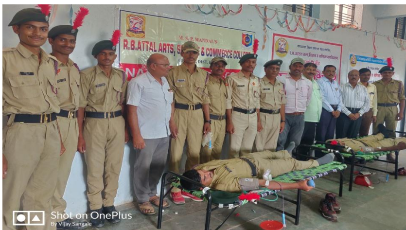
Cadets donating blood in presence of staff & cadets.