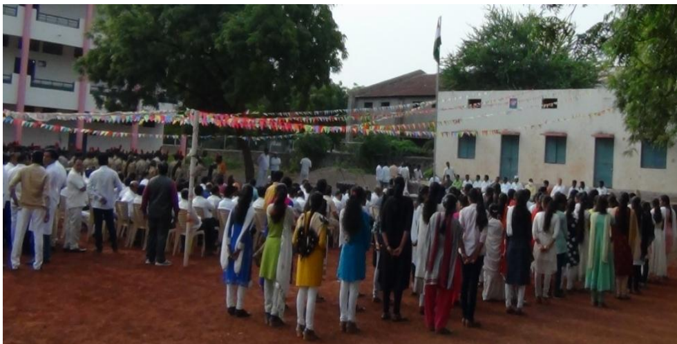
Students, Staff, NCC Cadets present on flag hoisting ceremony