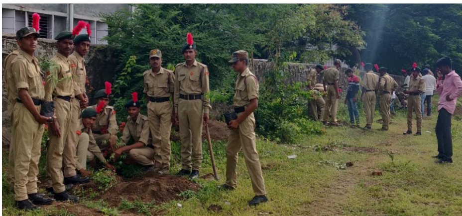
Cadets planting trees with NSS volunteers in college campus.