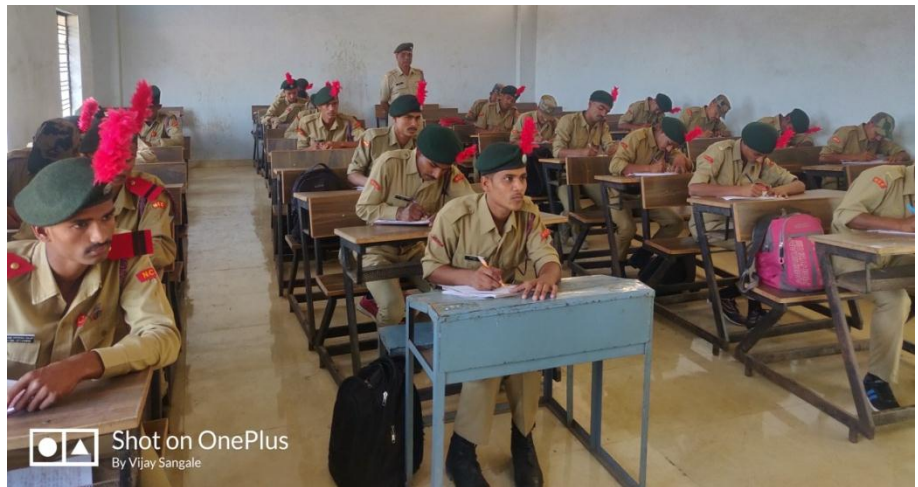
Cadets participated in the essay competition.